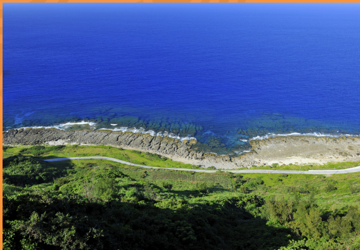
UNIQUE POINTS OF INTEREST