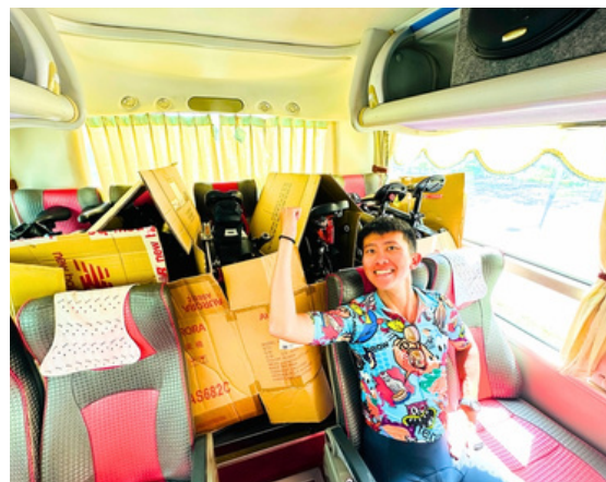
*Passenger vehicle and logistics vehicle support on cycling tours!