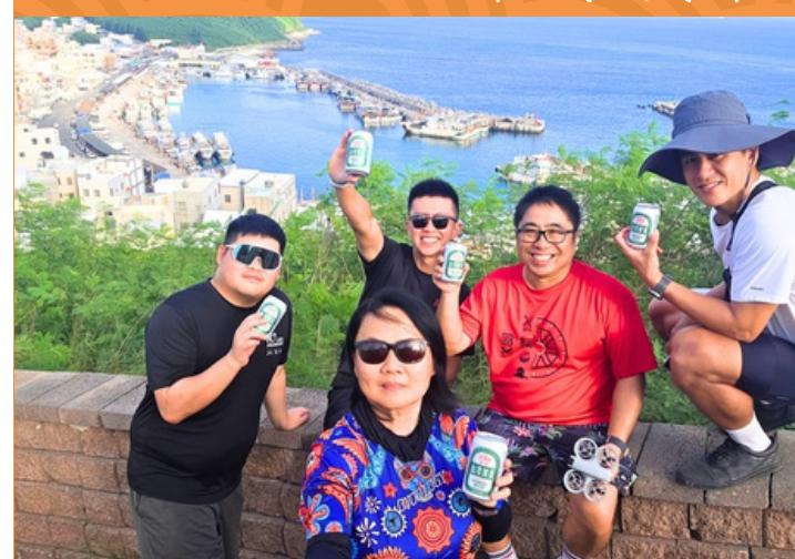
LITTLE GREECE VIEWPOINT