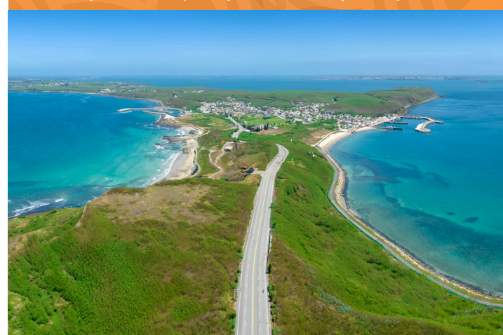
ISLAND RING ROAD