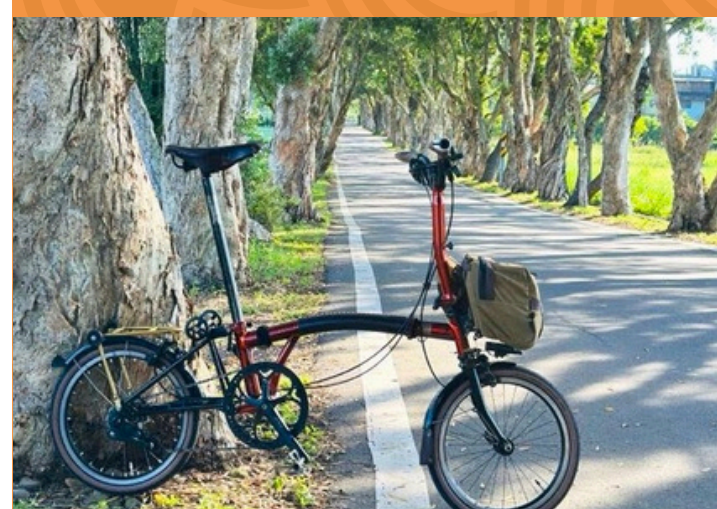
2 GROUPS CATERING TO PREFERENCES