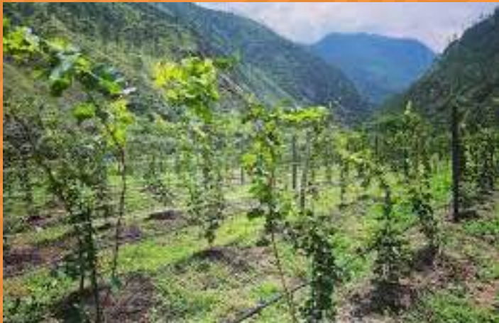
VINEYARD TOUR AND HARVESTING