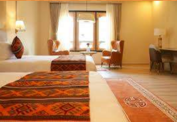
KAACHI GRAND HOTEL PARO