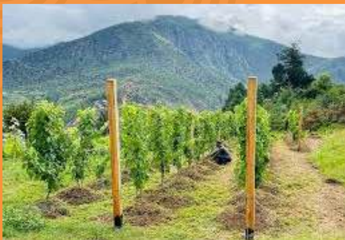
BHUTAN WINE COMPANY, PARO