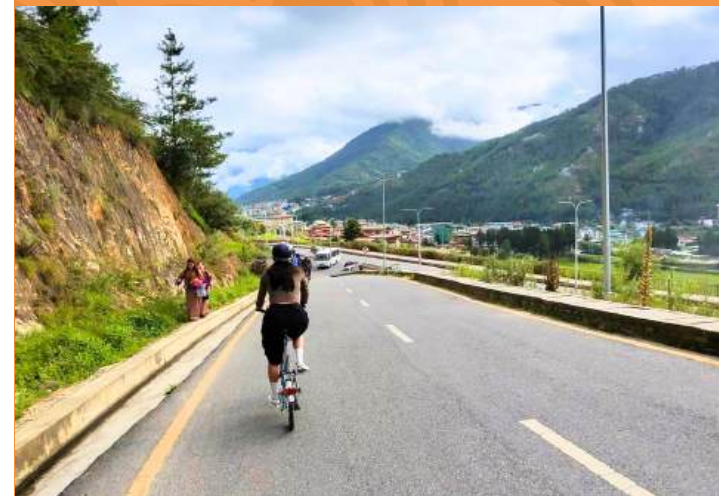
DOWN HILL ROAD WAYS