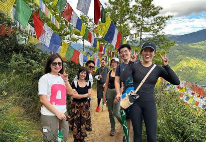
POST RIDE LEISURE HIKES