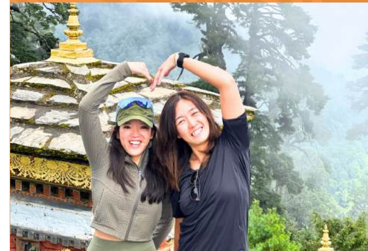
UNESCO HERITAGE SITES