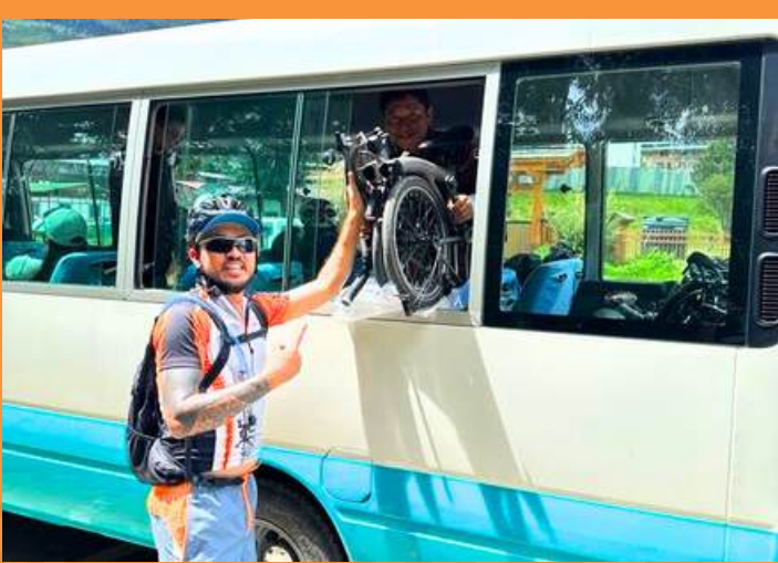
FULL BROMPTON SUPPORT