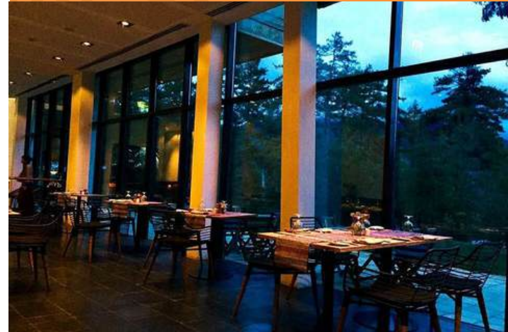
HOTEL ZHIWALING ASCENT DINING