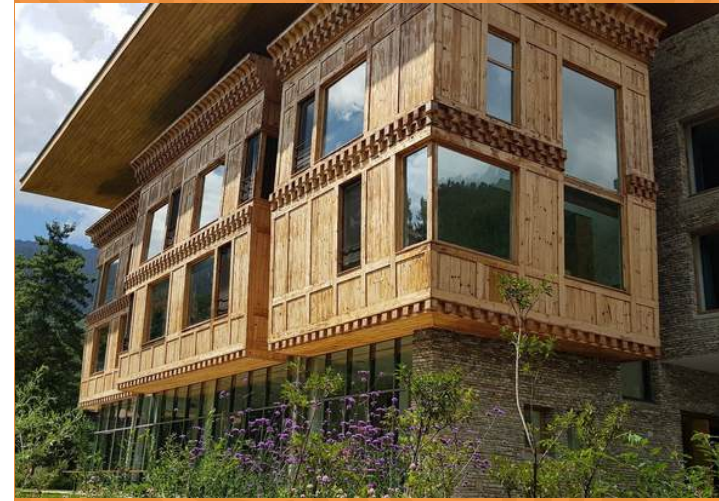
HOTEL ZHIWALING ASCENT