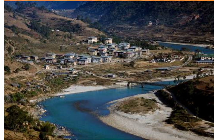
MO CHHU RIVER