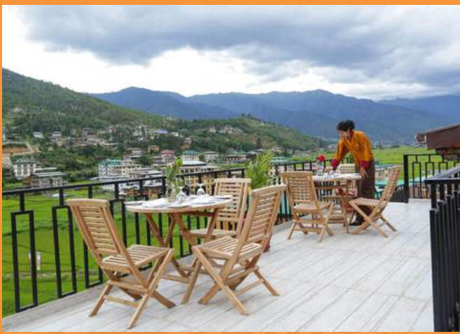
KAACHI GRAND HOTEL PARO