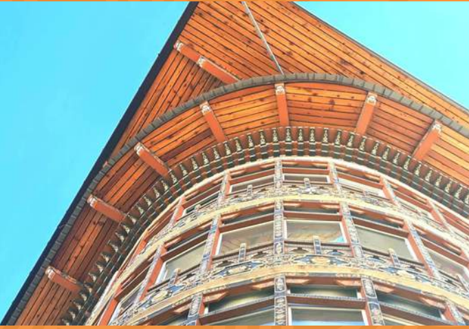
KAACHI GRAND HOTEL PARO