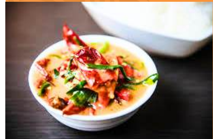
VARIETY OF CUISINE