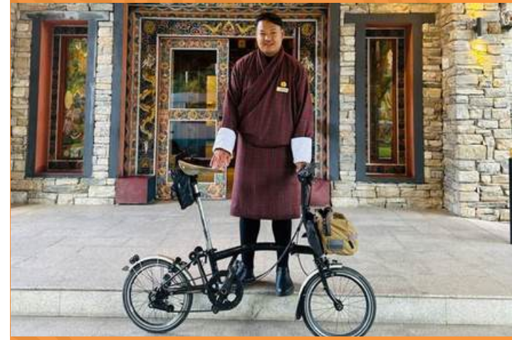
HOTEL ZHIWALING ASCENT ROOM